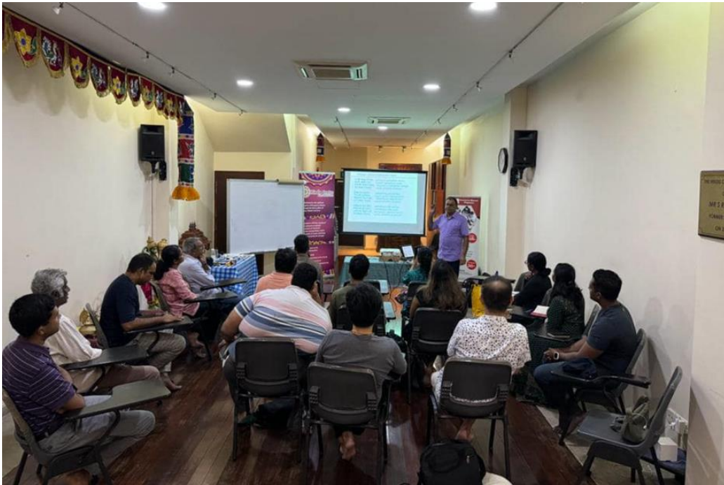
Samskritam Class in progress

Learning basic language asking questions with abhinaya, makes it stick to the mind. Breakout sessions to practice and familiarise ourselves. Thanks to Samskrita Bharati Singapore for bringing so many teachers to help us and to our 20+ students for being so very enthusiastic! Uttamam!