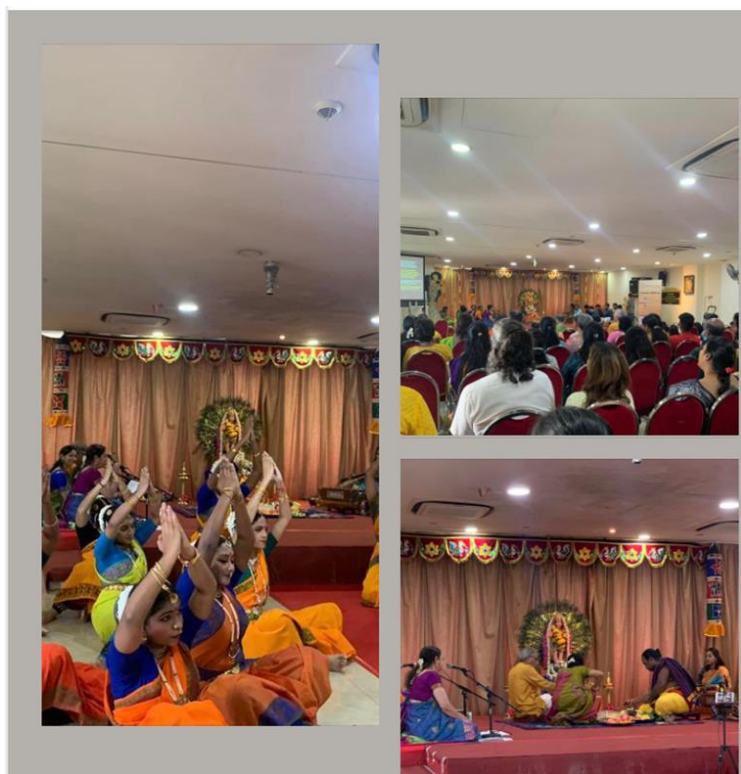
Full House at Sri Veeramakaliamman Temple Hall